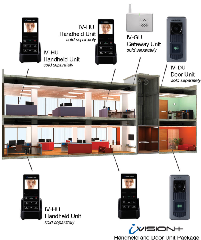
iVISION+ Handheld and Door Unit Package