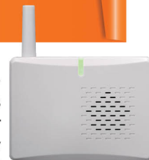
IV-GU Gateway Unit sold separately

Used alone with the iVision+, the Gateway Unit will act as an external chime when the Door Unit button is pressed.